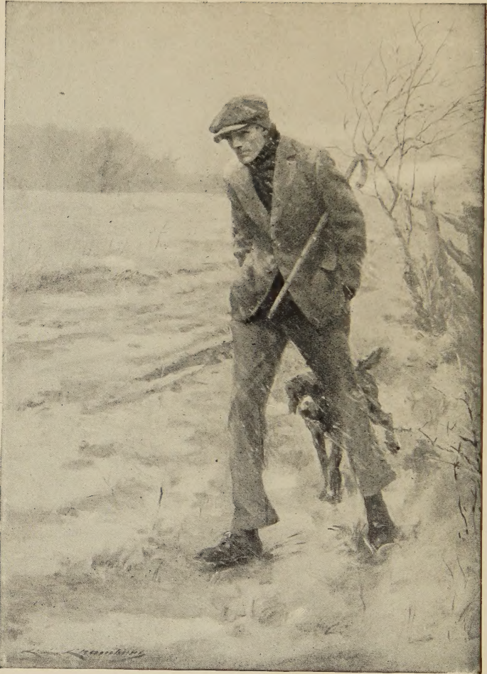
K. FOUGHT HIS BATTLE